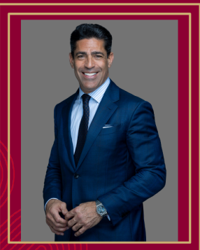
Randy M. Weber